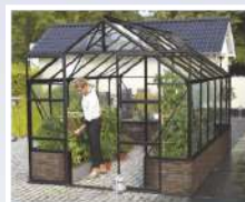
Cassandra 9900 Black