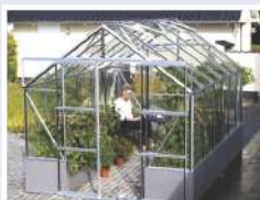
Cassandra 9900 Aluminium